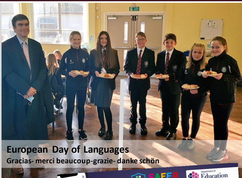
European Day of Languages Gracias- merci beaucoup-grazie- danke schön